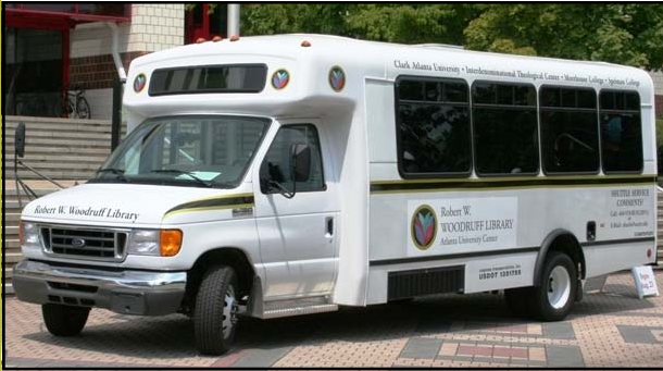
“The ABCs of Woodruff Transit,” introduced to riders in January include printed schedules, route maps and expanded operation of the Campus Express route.

Responding to rider needs, the Robert W. Woodruff Library (RWWL) of the Atlanta University Center in January introduced a new Shuttle Service concept for spring semester 2007—“The ABCs of Woodruff Transit” a new letter-oriented schedule and signage system that visually maps out shuttle routes, stops and arrival/departure times using letters of the alphabet.