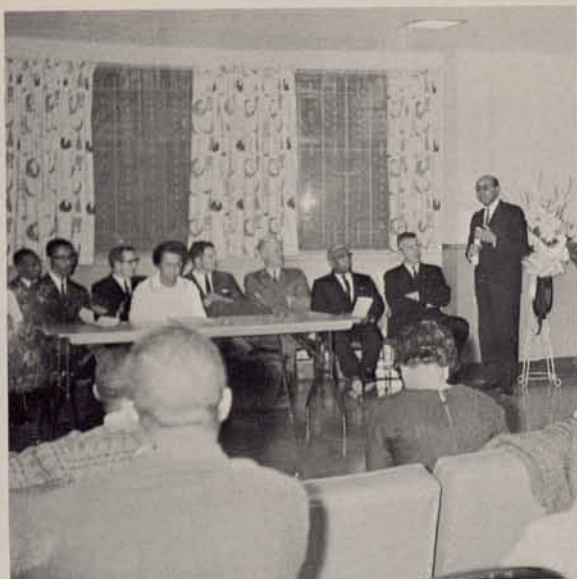
Here he talks to the student body in a lecture.