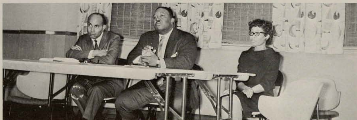
My Face is Black is reviewed here.