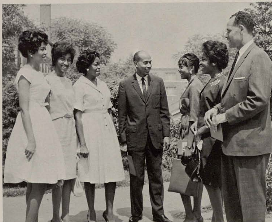
Here he pleasantly talks to students.