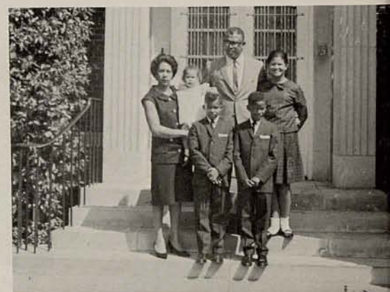
The First Family